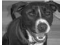
Boots is a 10-mth old male cross breed