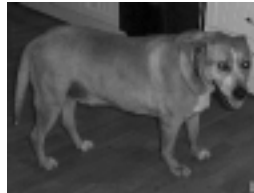
Rusty is a 7-yr old male cattle dog x