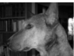
Roxy is a 6-yr old female kelpie x