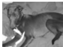
Scoobie is a 1-yr old male whippet