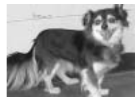
Harley is a 5-yr old male chihuahua x