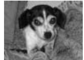
Rosie is a 12-yr old female chi foxy x