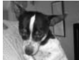
Rusty is a 4-yr old male chi foxy x