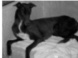
Matisse is a 4-yr old male greyhound