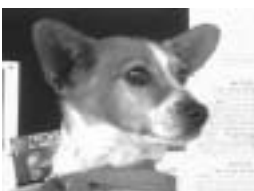
Dizzy is a 4-yr old M corgi x jack russell