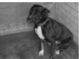
Jack is a 2-yr old male crossbreed