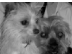
Snuggles & Snuffy are 18-mths & 6-yr old