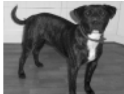
Jordy is a 1-yr old male staffy x