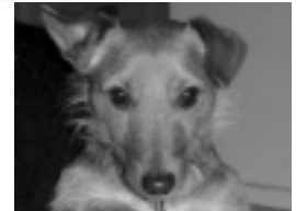
Checky is a 2-yr old male dachshund x