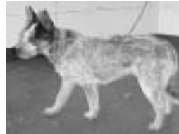
Charlie is a 10-mth old male cattle dog x