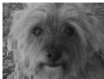
Mosh 'the bestest dog ever'