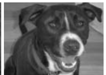
Boots 'we remember you always'