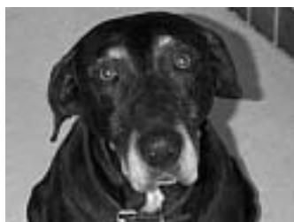
Nef 'our Alfa dog, leader of the troop'