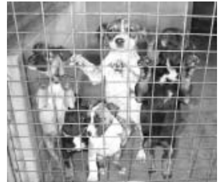
Too many dogs and not enough homes

Desexing can help dogs live longer, healthier lives. Desexing eliminates or reduces the incidence of a number of health problems. In females, desexing eliminates the possibility of uterine and ovarian cancer, and greatly reduces the incidence of breast cancer, particularly if she is desexed around the age of six months, before her first heat cycle.