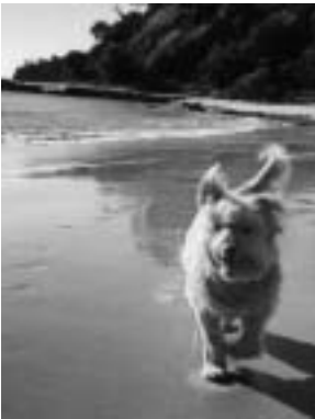
Social and health benefits

Desexing can make pets better and more enjoyable companions.