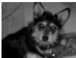
Toby is a 2-yr old male terrier x

Please call Nerida 02 6297 3437 www.fosterdogs.org