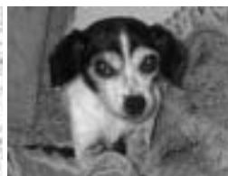
Rosie is a 12-yr old female chi foxy x

Please call Kate 02 6284 2345 www.fosterdogs.org