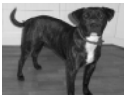
Jordy is a 1-yr old male staffy x

Please call Raelene 02 6236 3033 www.fosterdogs.org