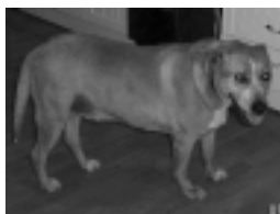
Rusty is a 7 yrs male cattle dog x staffy

Please call Raelene 02 6236 3033 www.fosterdogs.org