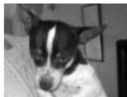
Rusty is a 4-yr old male chi foxy x

Please call Raelene 02 6236 3033 www.fosterdogs.org