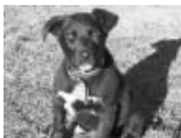
Astro is a male border collie x puppy

Please call Katie 02 6287 1151 www.fosterdogs.org