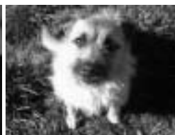
Ruski is a 2-yr old male terrier x

Please call Maree 02 6297 4308 www.fosterdogs.org