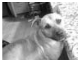
Nelson is a 2-yr old male ridgeback x

Please call Raelene 02 6236 3033 www.fosterdogs.org