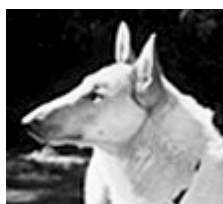
Scotty is a 2-year old Smooth Collie X.