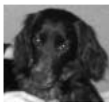
Kelly is a young female Cocker X.