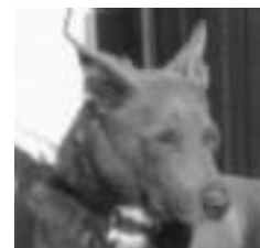
Rex is a handsome 2 year old male Kelpie.