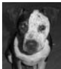
Harley is a sweet and loving young male.