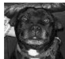
Monty is a 5-year old Staffordshire Terrier.