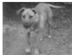
Rani is a large & active 10-mth old female x

Please call Raelene 02 6236 3033 www.fosterdogs.org