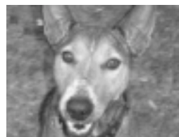
Roxy is an intelligent 5-year old Kelpie x