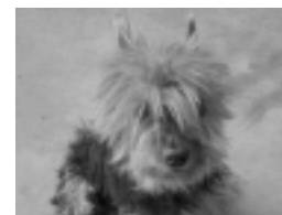
Arkie is a sweet 10-year old Yorkie x