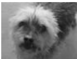
Luke is an 8-yr old Silky x (special needs)

Please call Virginia 02 6231 7508 www.fosterdogs.org