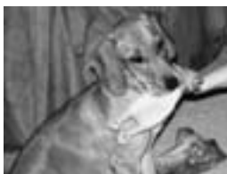
Holly is a cuddly 9-mth old female x

Please call Raelene 02 6236 3033 www.fosterdogs.org