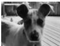
Eve is a friendly 7-mth old female x

Please call Paula 02 6253 0308 www.fosterdogs.org